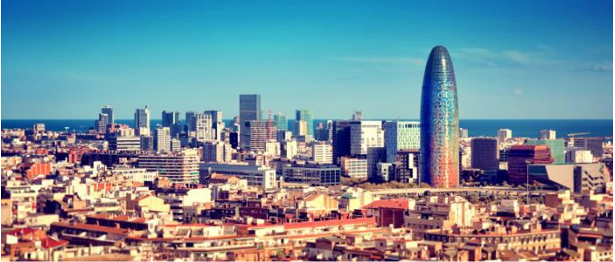
Ciudad de Barcelona