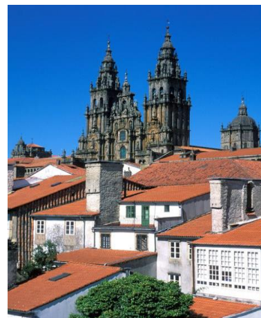
Cathedral of Santiago de Compostela