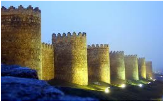
Avila- medieval city walls

Segovia is located 85 kms north-northwest of Madrid. The name Segovia is of Celtibero origin. The first inhabitants called the city Segobriga. This name comes from two terms of the Celtiberan language of the Celtic branch of Indo-European. The term Sego means "victory" and the suffix -briga would mean "city" or "strength". So the name could be translated as "City of Victory" or "Victory City". The city is famous for its impressive Roman Aqueduct perfectly well preserved since 2000 years ago. Back to Madrid. Tapas dinner with wine in a typical restaurant in the city center. Overnight in Madrid.