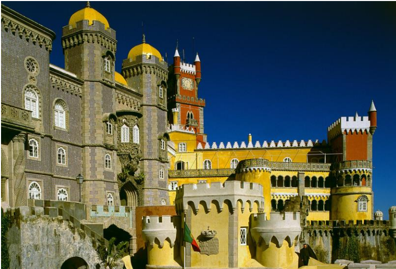
Pena Palace in Sintra