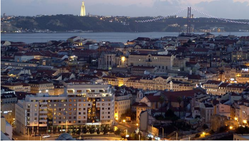
Lisbon view from St. George's Castle