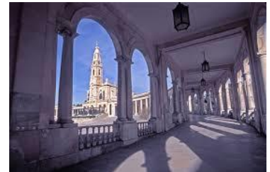
Sanctuary of our Lady of Fatima