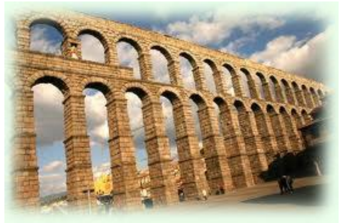
Segovia- Roman Aqueduct