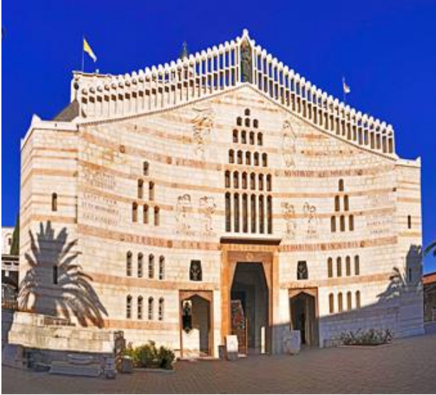
Basilic of the Annunciation, Nazareth

transforming water into wine, in that place the couples who are present will renew their marriage promises. We will continue through the Basilica of the Annunciation in Nazareth where we will celebrate Holy Mass. Then we will visit the well of Mary and the Church of the angel Gabriel. We will have dinner and spend the night in Tiberias.