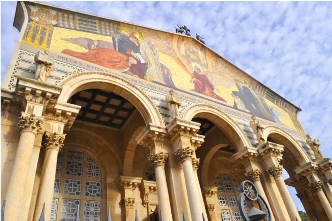
Church of All Nations, Jerusalem, Israel

on the greatness of his sacrifice for us. Finally, we will arrive at the Church of the Holy Sepulcher to hear Mass. After breakfast at the hotel, we will return to the ancient city of Jerusalem to visit the Church of St. Anne, the home of the Virgin Mary and her parents St. Joachim and St. Anne. We will pass by the Ecce Homo place where Pilate proclaimed Ecce Homo (Behold the Man), then we will visit the Western Wall, the holiest place for the Jews. We will visit the Superior Room, the place of the Last Supper. Then we will leave for Dormition Abbey, where the Blessed Virgin ascended to heaven. We will end the day at St. Peter's in Gallicantu, where Peter denied Jesus three times. Dinner and overnight in Jerusalem.