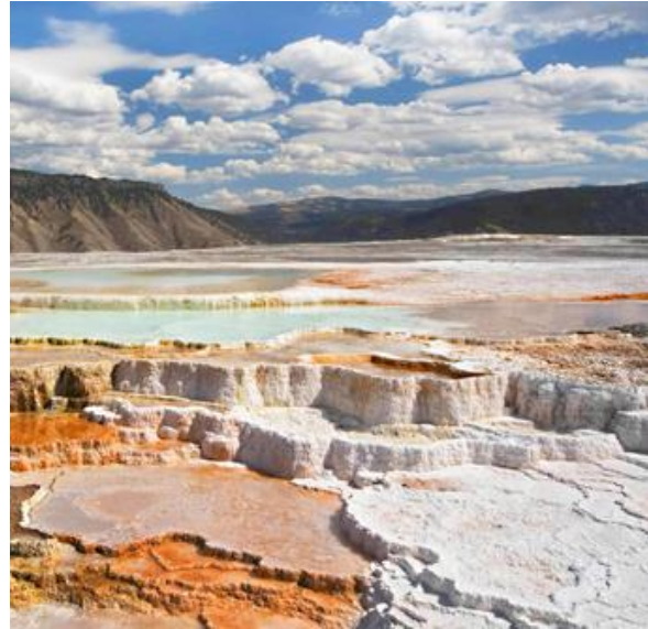
El Mar Muerto, Israel