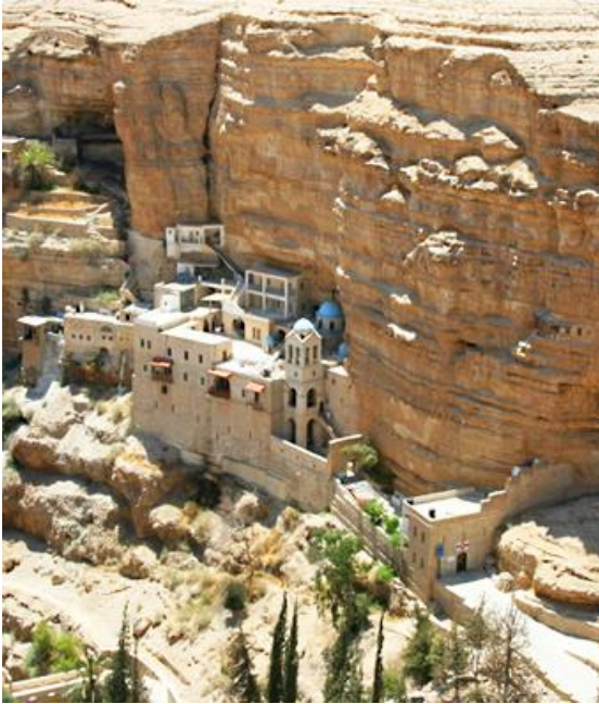
Monasterio de St. George, Israel