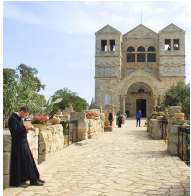
Pope Francis on the Wall Church of the Transfiguration, Mount Tabor