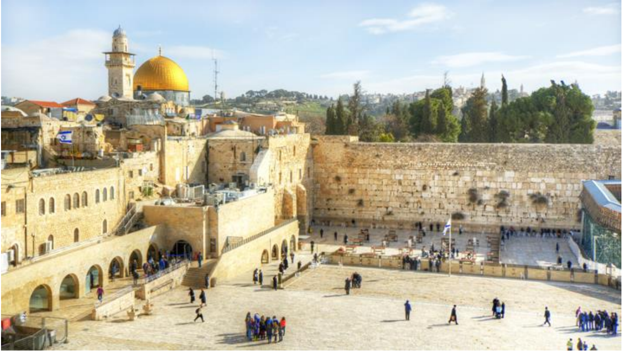
Western Wall, Jerusalem, Israel