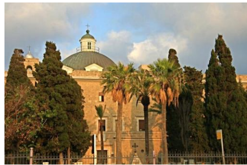
Monastery de Stella in Haifa