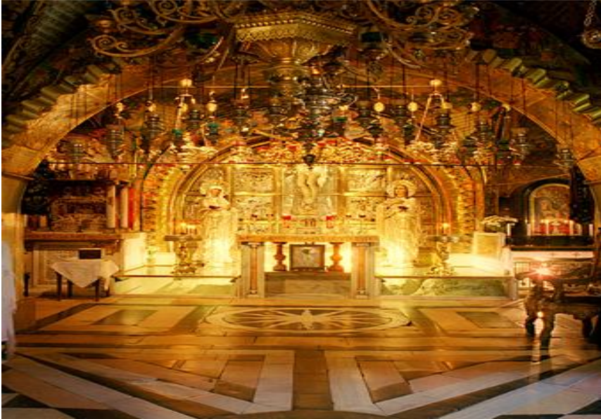
Church of the Nativity in Bethlehem