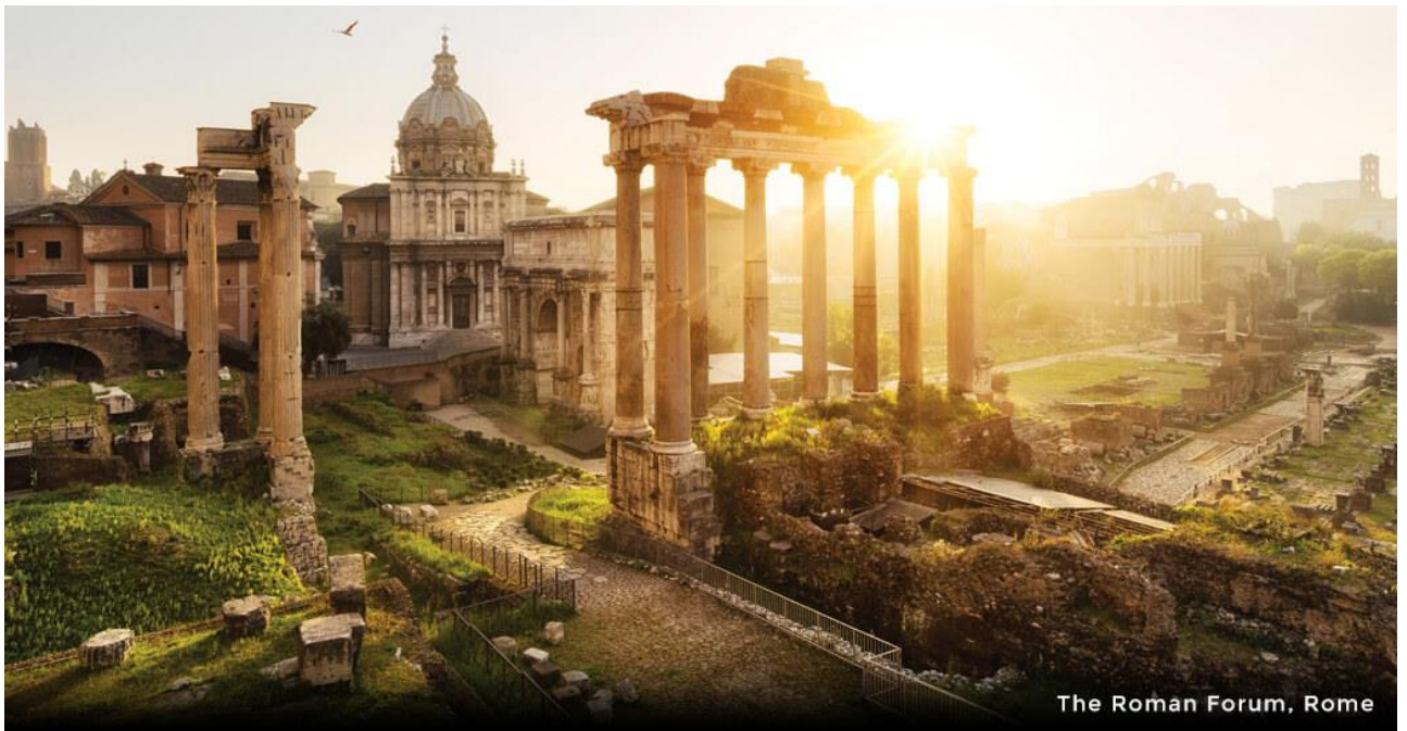
The Roman Forum, Rome